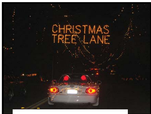
In case you doubted