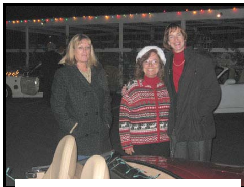
Three pretty ladies