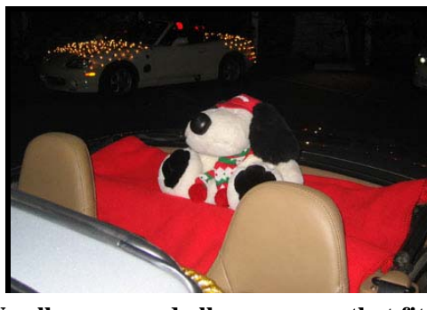
We allow any and all passengers-that fit