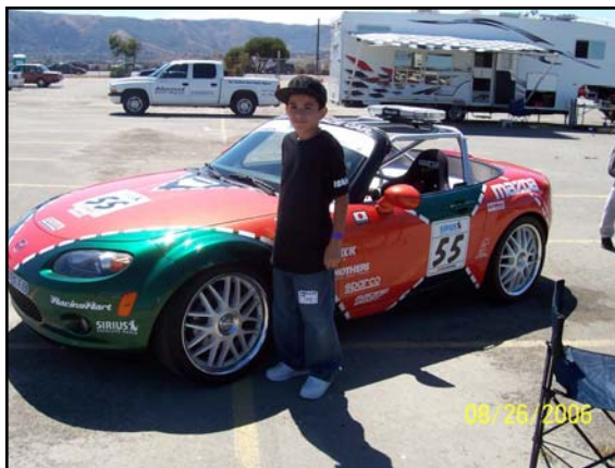
Nephew and the MX-5 pace car from Mazda Raceway Laguna Seca