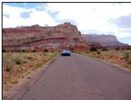
Capitol Reef National Park