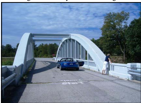
Rainbow Curve Bridge, Route 66, Kansas