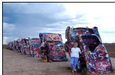
Cadillac Ranch, Amarillo, Texas