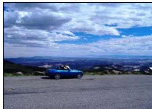
Somewhere in Eastern Utah