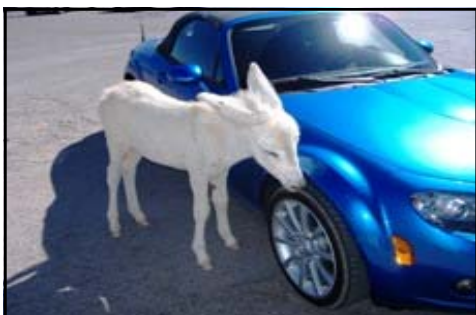
Young burro really likes Winning Blue